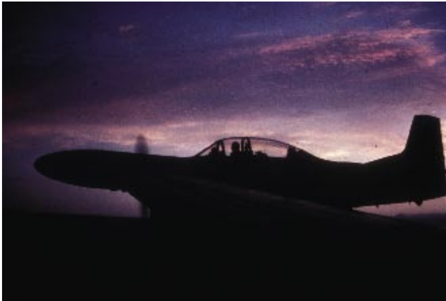
In the background, a T-28 is silhouetted against the darkening sky. In July 1967, the North Vietnamese struck Luang Prabang airfield, destroying about a dozen T-28s belonging to the Laotian Air Force.

media had given the public a reasonably accurate picture. The issue for us was to what extent an official acknowledgment of our operations in Laos would wreck what was left of the 1962 accords, give Hanoi a pretext for further stepping up its aggression in northern Laos, and fuel even more passionate controversy at home. Our role in Laos had been 'secret' in three Administrations of two parties precisely because each President wanted to keep it limited."