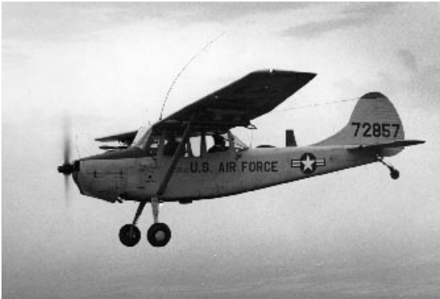
Aircraft such as this O-1 performed forward air control tasks. Water Pump commandos, enlisted airmen, and nonrated officers served in the FAC role from 1964 until the spring of 1967.

weather or other reasons, from targets in North Vietnam.