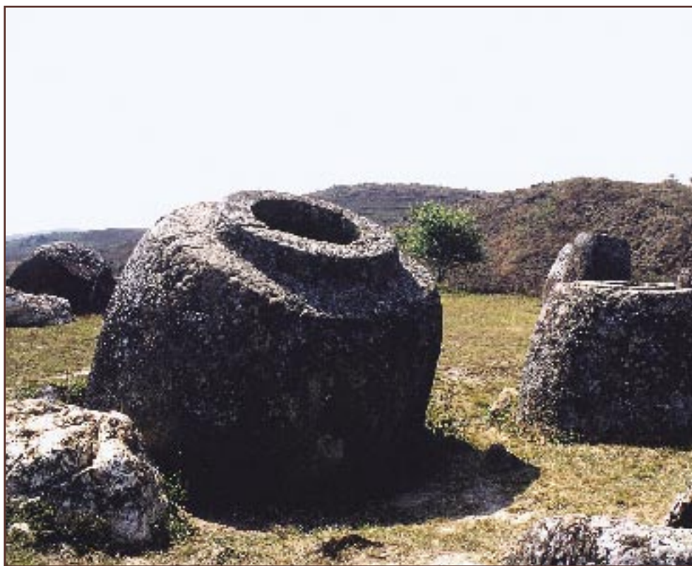
Thousands of ancient stone jars dot the plains in the center of Laos.

group, about 750 people, left promptly, but no more than 40 of the 7,000 North Vietnamese troops in Laos ever went home. Pathet Lao strength increased after the cease-fire, and the civil war resumed full tilt.