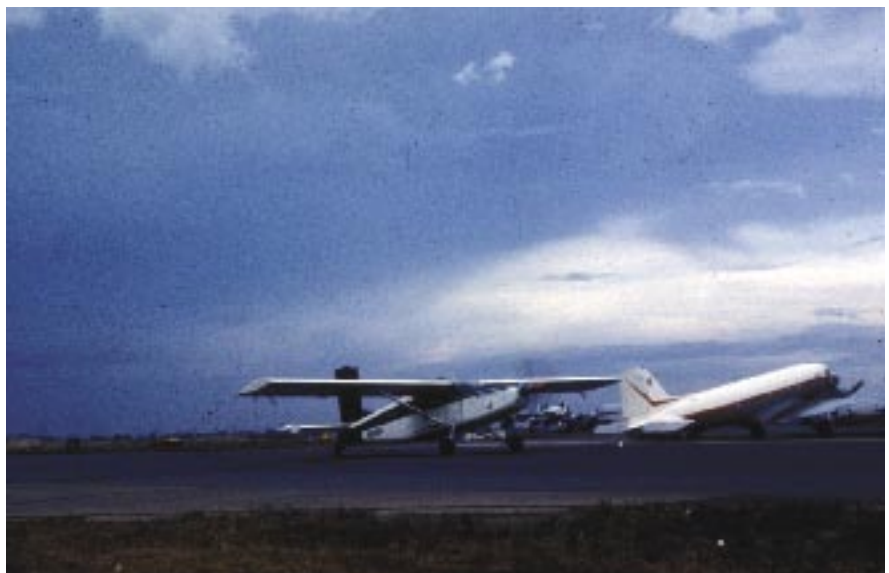
At top, a USAF T-28 sits on the runway at Nakhom Phanom AB, Thailand. In April 1964, the US sent air commandos to train Laotian aircrews in counterinsurgency tactics and to assist with aircraft maintenance. Above, a PC-6 Turbo Porter sits among other aircraft at Udorn. These airplanes were flown by Air America in support of CIA operations.

Also in May, US jet aircraft began flying "Yankee Team" reconnaissance