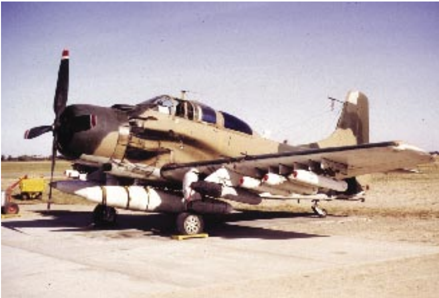
This A-1 Skyraider was stationed at Udorn AB, Thailand. US Ambassador William Sullivan, dubbed “field marshal” for his power struggles with military leaders, believed propeller aircraft were well-suited for the war in Laos.

fined his activities to the royal capital at Luang Prabang. The government ran from the administrative capital at Vientiane.