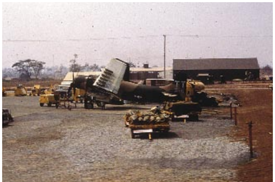
A-1 Skyraiders, such as the one shown here at a Southeast Asia airfield, had long loiter times, delivered close air support with great accuracy, and could fly from short airstrips.

In April 1964, the Air Force sent a detachment of air commandos under Project Water Pump to train Laotian aircrews in counterinsurgency tactics